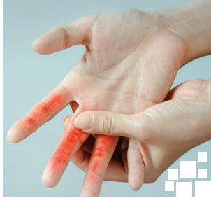
Arthritis and Joint Pain