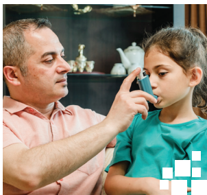
Asthma in Winter